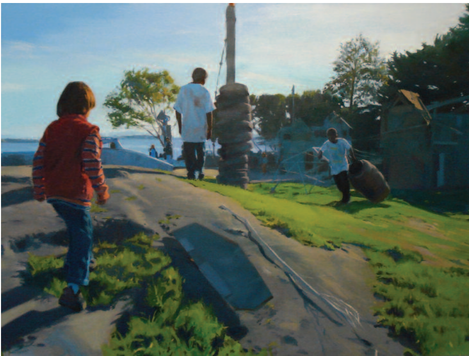
DISCOVERY PARK 2008, OIL ON LINEN, 45 x 60 IN. COLLECTION OF THE ARTIST

In The Hike , which Goldstein says is a complement to Discovery Park , a group of male and female figures head off into an open, decidedly Western landscape, one that is both enchanting and daunting. Again, although the figures include Goldstein’s wife, mother, and son, the scene is not one