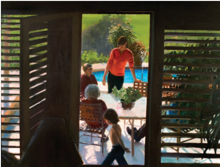
THE VISIT 2007, OIL ON LINEN, 58 x 76 IN. PRIVATE COLLECTION

chiefly done by Bay Area artists, including three significant canvases by Goldstein. “Stan’s figures are never static. They are people in action.”