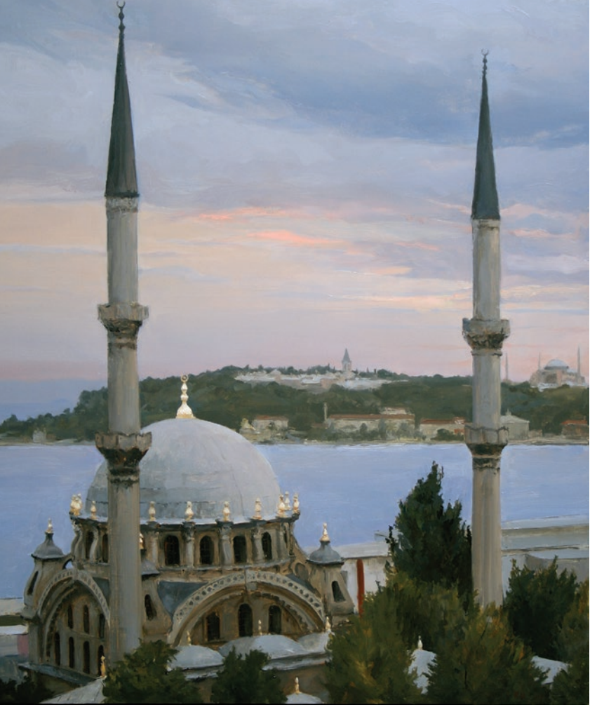
Nusretiye Mosque with Old City, Istanbul 2012, Oil on panel, 24 x 20 in. Private collection

has after a person has left it, that the room is charged with their energy," the artist explains. "I don't put people in my interiors because as soon as a person appears in a painting, you start wanting to know what the person is doing or thinking — and that confuses the character of the space itself. For me, it's not about ghosts, not that mystery at all, but the idea that an interior, a room, a space, still registers a person's having occupied it."