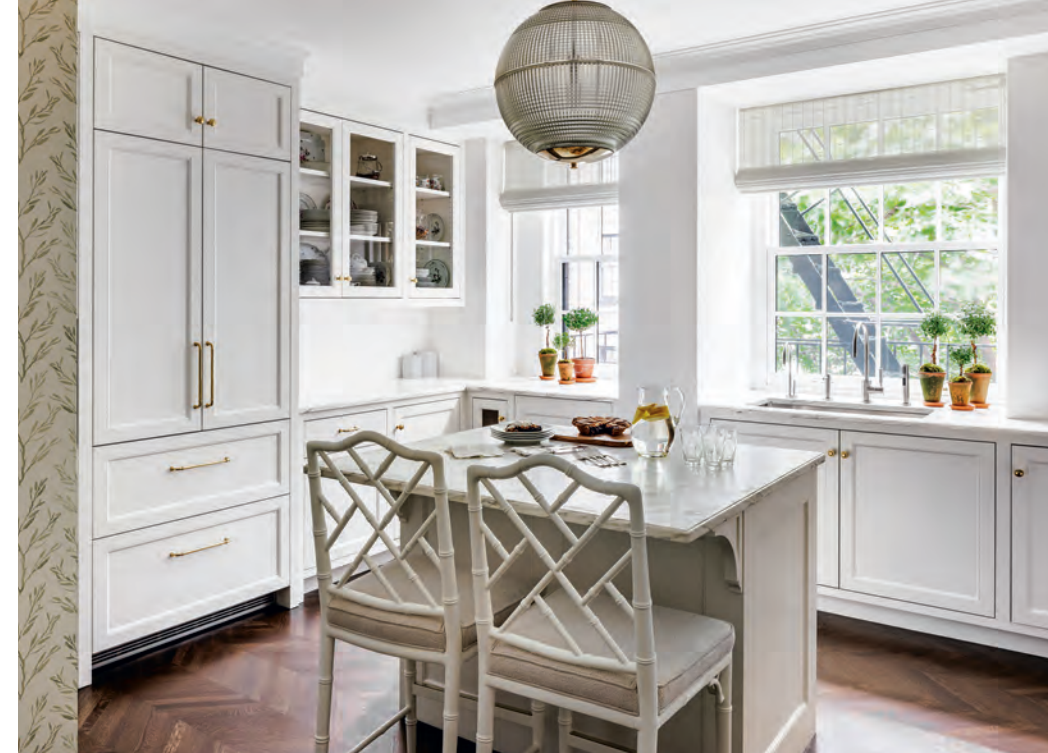
Guilty Pleasures (OPPOSITE) In the dining room, chairs from Cedric Dupont Antiques surround a custom glass table by Bryant Glass & Shower Doors. The hand-painted wall covering is by Artgroove and the chandelier is from Scalamandré. (THIS PAGE LEFT) In the kitchen, a ceiling fixture from Ann-Morris Inc. hangs above an island by Vella Interiors. The barstools are from Artistic Frame. (THIS PAGE BELOW) An antique high-back chair upholstered in a Claremont fabric and a French Louis XVI ebony and brass-inlay vitrine occupy a corner of the living room. See Resources.